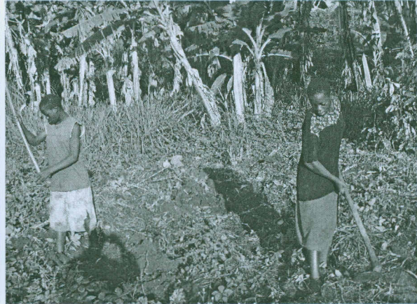
Beneficiaries tour and admire a garden as part of the farmer to farmer visits. Children prepare their mother's garden