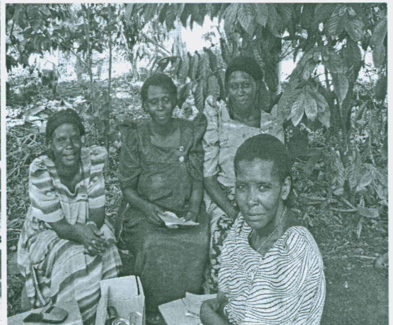
Some of the beneficiaries at two of the training sessions under the fruit and vegetable growing project