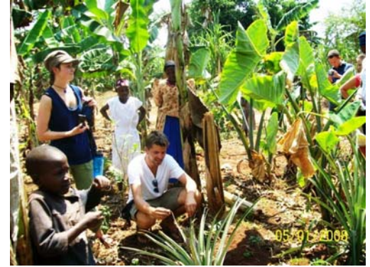
Volunteers visit farmers' homes to learn about livelihood activities