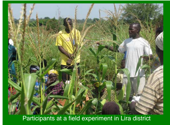
Participants at a field experiment in Lira district

growth stages in rain-fed cropping systems. It explores ways of minimizing nutrient losses and increasing nutrient inputs using a low-cost approach. The goal of the project is to increase commercial and household agricultural production and build professional capacity in adapting to climate change.