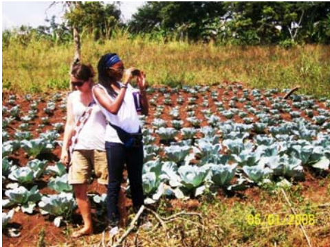
OG volunteers visiting a farmers' vegetable garden in Butikiro

7,500 is being sought to fully support farmers' access to seeds, technical training, extension support and technical advice.