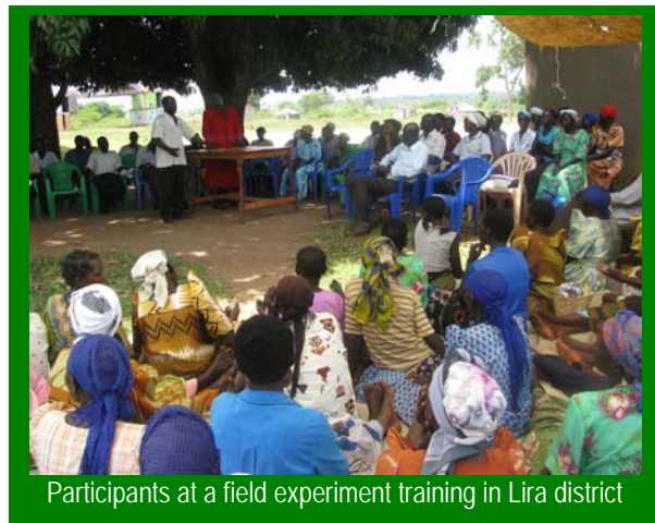
Participants at a field experiment training in Lira district

Twenty (20) field experiments in Lira and Iganga districts and a series of field visits have been made to the two districts by the core research team, the Project coordinator, collaborators, academic supervisors and students. During this time, a baseline study on the socio-economic characteristics in the project area was also conducted ( http://www.slint.org/climate-adaptation.html )